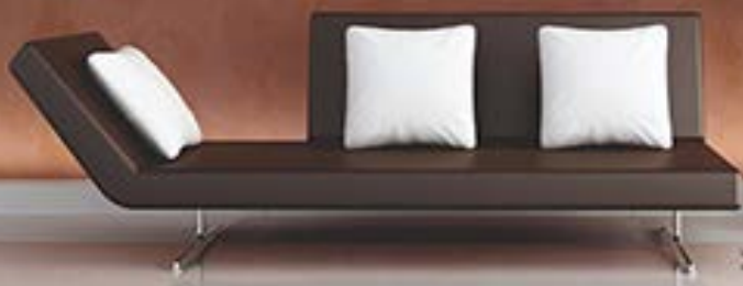
Interiors are built with an aesthetically appeal & addressing of the basic human needs of the same time using quality material.